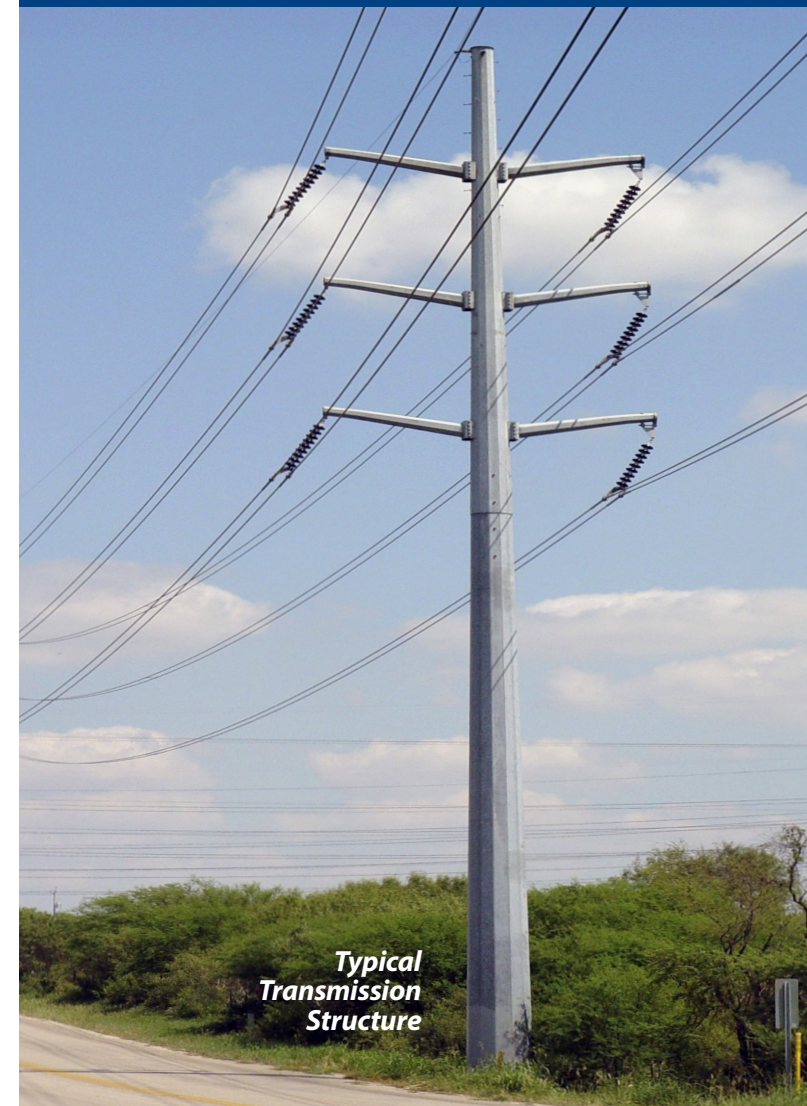
Typical Transmission Structure